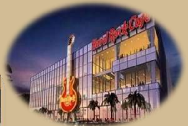
Hard Rock Cafe Las Vegas