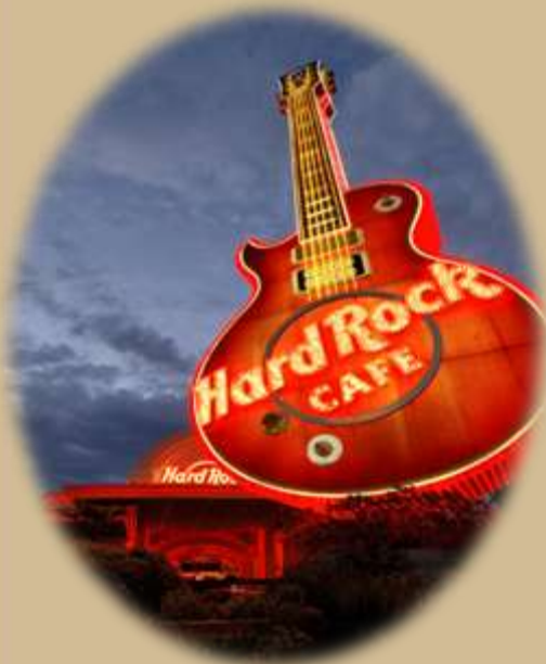
Hard Rock Cafe @ Hard Rock Hotel